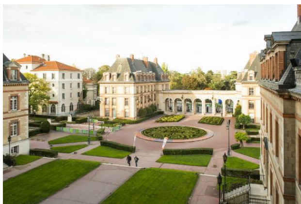
The Campus of the Cité Internationale

The building, designed by the architect Nicolas Zahos and inaugurated during the interwar period, combines a neoclassical style with Art Deco references. The Hellenic Foundation was entirely renovated in 2021 and all of its rooms have private shower rooms, toilets and kitchenettes.