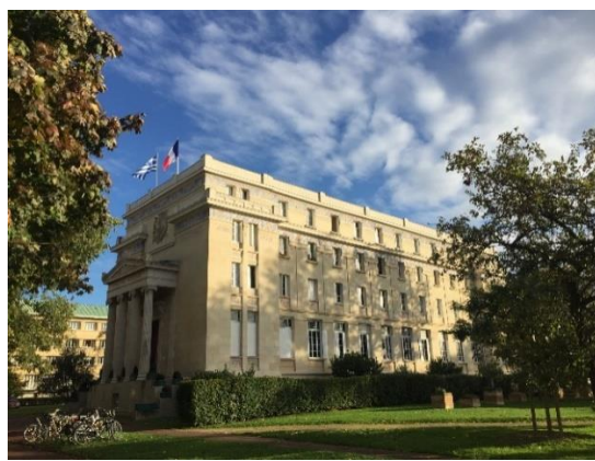
The building of the Fondation Hellénique